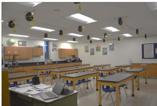
(Updated Lecture Hall - Room 300 and High School and Middle School Science Labs)

As you may have read earlier this month, the Sandusky Board of Education voted to take a bold and strategic new direction with the Building Better Dreams facilities program. Our timeline for opening the new Intermediate School and the new Ontario Building is scheduled for August 2020. A new construction management at-risk firm should be on board in December, and we will continue onto the next phase of the building process. We are excited to see our plans come to life and to move forward with our vision. To learn more about our facilities project, you can visit our website.