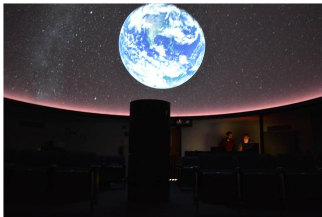
(Newly Renovated Sidney Frohman Planetarium)